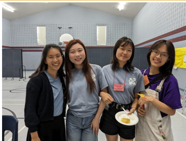
The 4 coordinators for the 2 camps