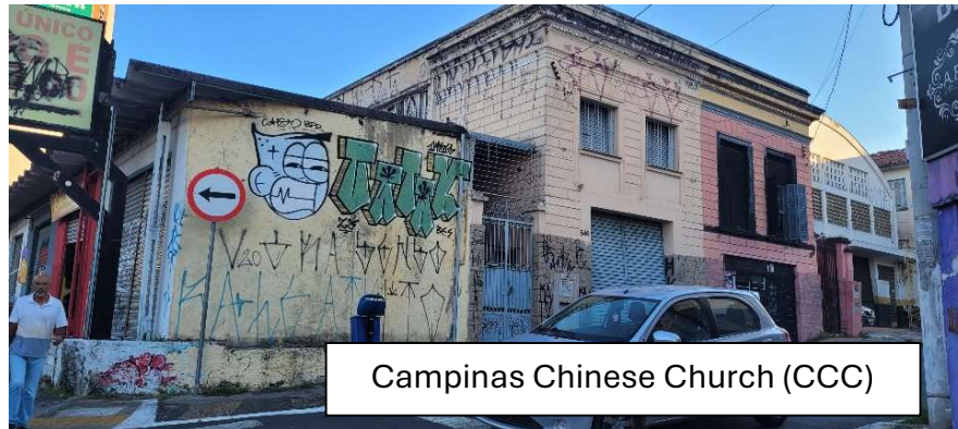
Campinas Chinese Church (CCC)

(WCAC), and individual brothers and sisters. We would like to give thanks to our Lord, CCACA MAT, WCAC and our supported brothers and sisters.