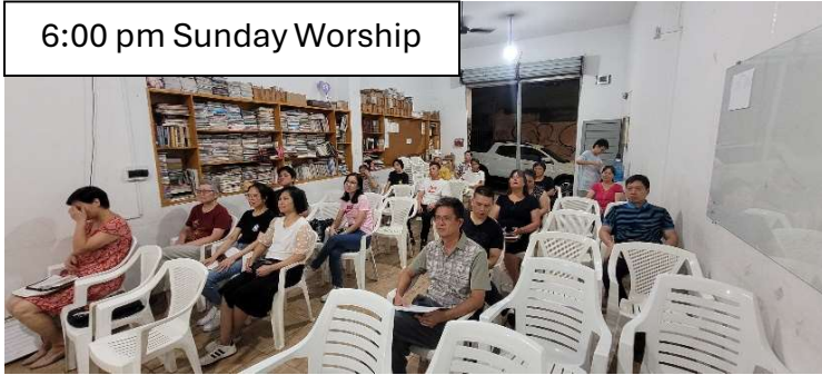
6:00 pm Sunday Worship