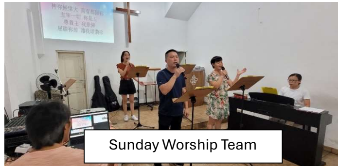
Sunday Worship Team