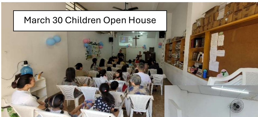
March 30 Children Open House

one. During the children's activities, I have prepared a SOBEM (恩雨之聲) video with a short sharing with the parents who stayed behind for their