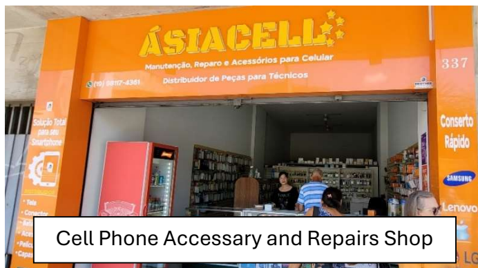
Cell Phone Accessory and Repairs Shop

Campinas, Brazil, is located approximately 100 km northwest of Sao Paulo, Brazil, and has over 1 million population including a few thousand Chinese. The Campinas Chinese Church (CCC) is