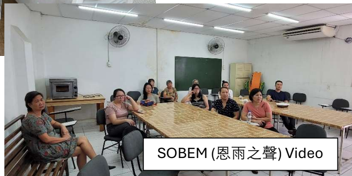
SOBEM (恩雨之聲) Video

one. During the children's activities, I have prepared a SOBEM (恩雨之聲) video with a short sharing with the parents who stayed behind for their