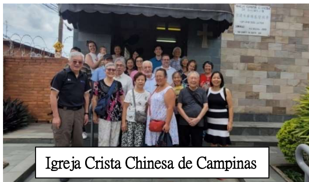
Igreja Crista Chinesa de Campinas

Campinas (金邊市華僑基督教會) next Sunday. Before we left Campinas, she also invited us to her apartment for lunch. Our God is an amazing God and He provide company to us. “We walked in the house of God with the throng. (Ps 55:14b)